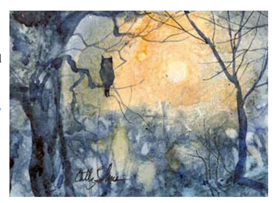
Art 93-2, Lighten up!

In this case I'd just been playing with gesso as a painting ground, and chose several areas of the original sample to finish up as these tiny playing-card size paintings, http://cathyjohnsonart.blogspot.com/2008/12/winter-owl-aceoatc.html