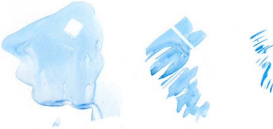
109-3, Yupo cat